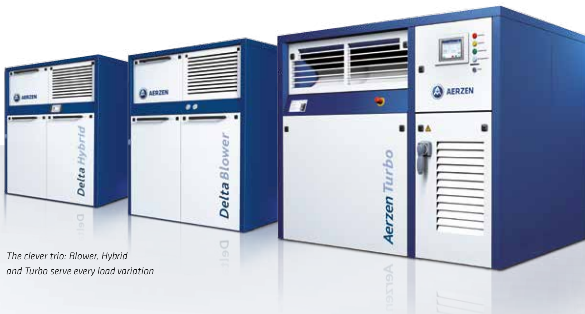
The clever trio: Blower, Hybrid and Turbo serve every load variation